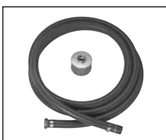
FP2735 Suction Hose Kit