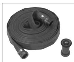
FP2731 Discharge Hose Kit